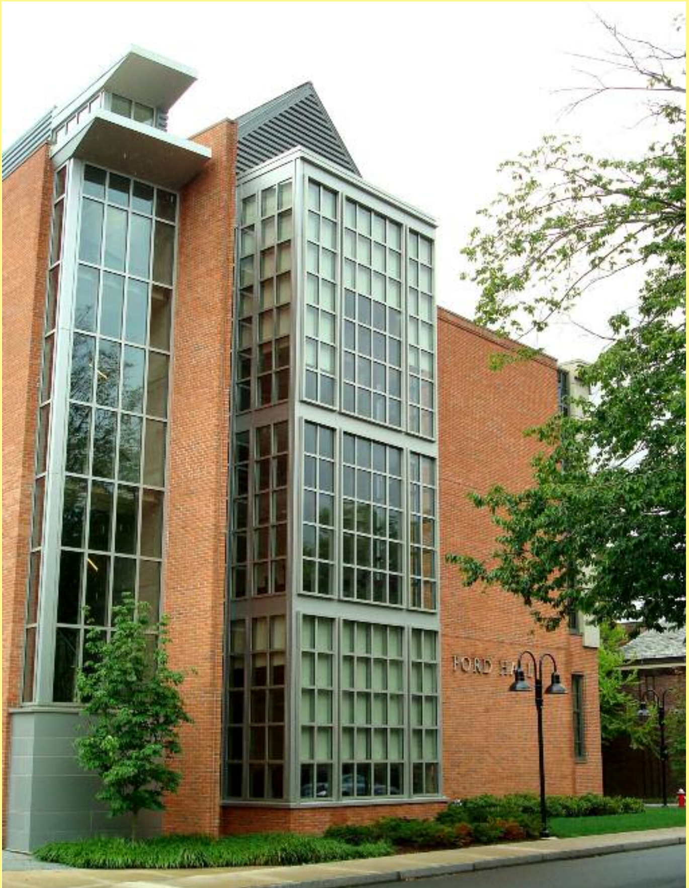
Ford Hall picture gallery, all photographs courtesy of Dorothy Gilbert