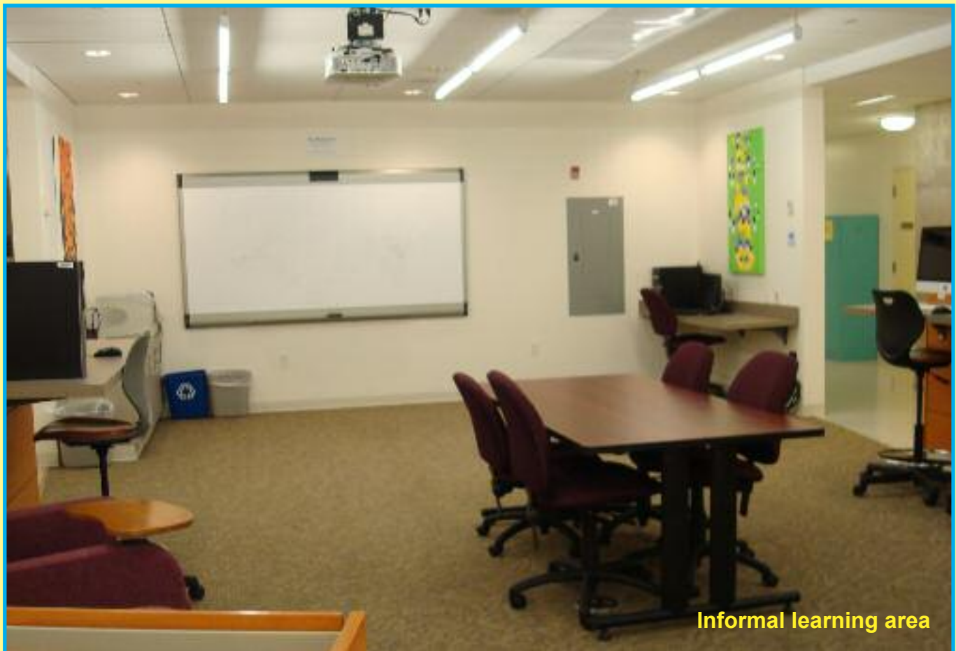
Informal learning area