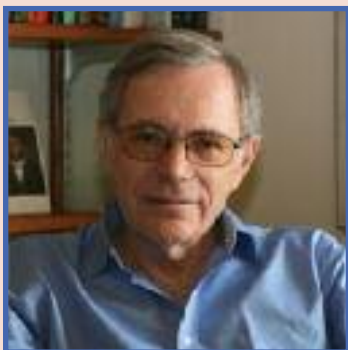
Eric Foner, author of The Fiery Trial